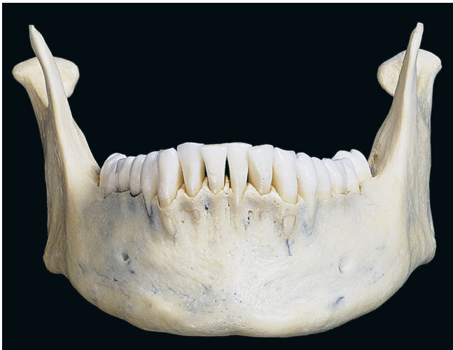
Figure 1.2 The mandible. (From Abrahams PH, Spratt JD, Loukas M, van Schoor AN. McMinn and Abrahams' Clinical Atlas of Human Anatomy . 7th ed. St Louis, MO; Mosby; 2013.)

The majority of the anterior cranial fossa consists of the orbital plates of the frontal bone, which form the roofs of the orbits. The orbital roofs bear impressions that mirror the undulating sulci and gyri of the overlying cerebrum. An explanation of how the gelatinous brain might influence the structure of rigid bone is found in Melvin Moss's functional matrix hypothesis, which states that the development of bone sequentially follows, and is thus dependent on, structural changes in the collections of developing soft tissues called functional matrices . The cerebrum would thus be a component of the functional matrix for which the associated bone is the frontal bone, or more specifically, the orbital plates of the